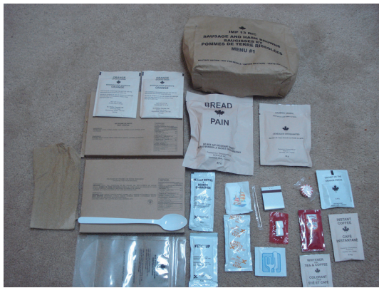
Fig. 2 An example of an individual meal pack (IMP).

IMPs typically contain an entrée, fruit, cereal (breakfast), bread option, beverage options (e.g., hot beverages/sports drink crystals), spreads/condiments (e.g., jam/peanut butter, hot sauce, sugar), candy/chewing gum, salt/pepper, utensils, beverage pouch, matches, Kim towel, toothpick, and a moist towelette